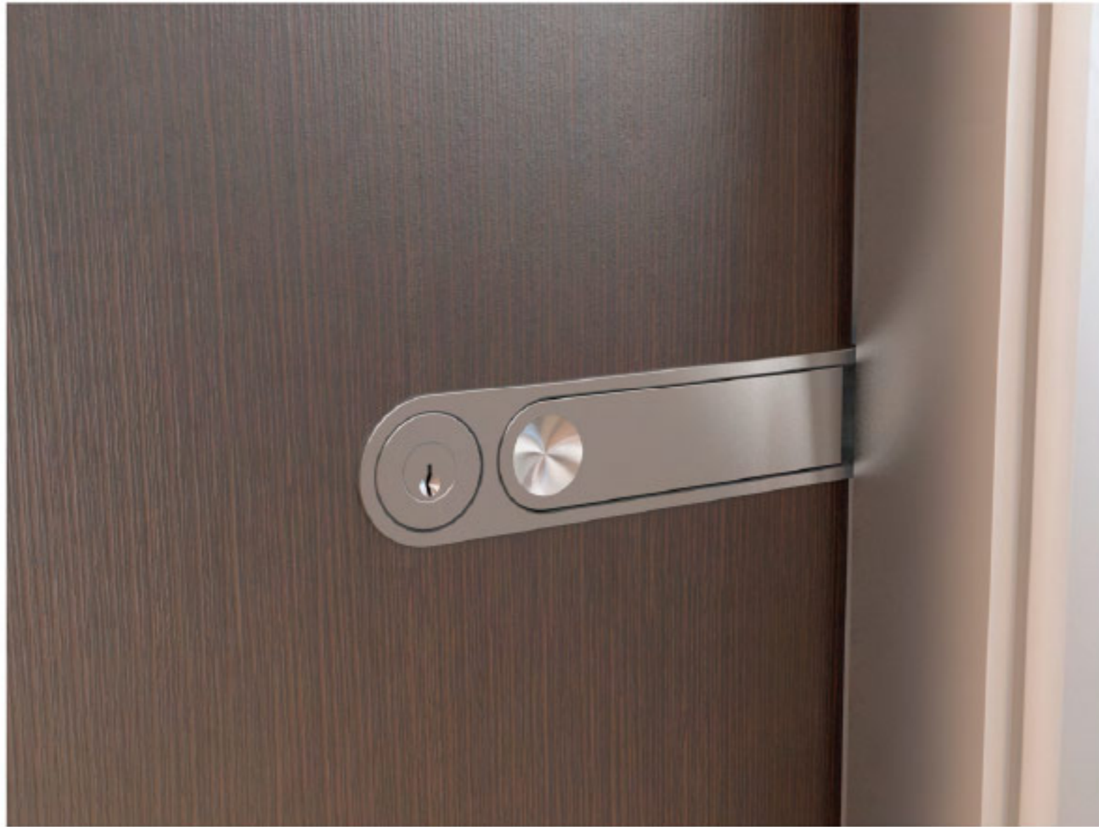
Integrated single action door opening system